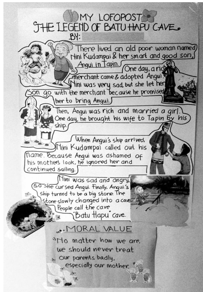
Figure 2. Student example of lofopost.